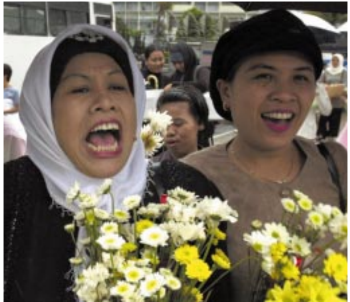
Clockwise: A Chilean woman speaks out against former dictator Augusto Pinochet; Indonesian women call for peace as they protest the parliamentary committee investigating President Abdurrahman Wahid for alleged corruption; Japanese activists demand the withdrawal of U.S. Marines from Japan.